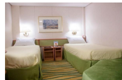
Inside Stateroom 内侧客房