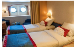
Oceanview with Porthole 舷窗海景客房