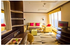
Executive Suite with Balcony 行政露台套房