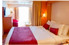
Superior Stateroom 豪华窗户海景客房