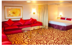
Junior Suite 豪华套房