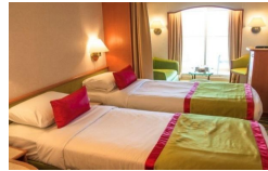
Oceanview with Balcony 露台海景客房